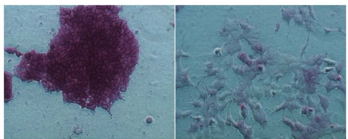
Figure 1: AP staining of ES Cells. Murine embryonic stem cells (ES-D3) are maintained in an undifferentiated stage on gelatin-coated dishes in the presence of LIF, as indicated by the high AP activity. To induce differentiation, LIF was withdrawn over a period of several days; various differentiation events were observed (cells became flattened and enlarged with reduced proliferation). At the end of day 5, AP staining of undifferentiated cells was performed with the StemTAG<sup>TM</sup> Alkaline Phosphatase Staining Kit (Cat # CBA-300).