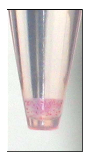
Figure 1 : Raf1 RBD Agarose beads, in color, are easy to visualize, minimizing potential loss during washes and aspirations.

Cell Biolabs' N-Ras Activation Assay Kit provides a simple and fast tool to monitor the activation of N-Ras. The kit includes easily identifiable Raf1 RBD Agarose beads (Figure 1), pink in color, and a N-Ras Immunoblot Positive Control for quick N-Ras identification. This Trial Size kit provides sufficient quantities to perform 5 assays.