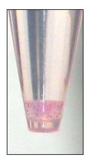
Figure 1 : Raf1 RBD Agarose beads, in color, are easy to visualize, minimizing potential loss during washes and aspirations.

Cell Biolabs' Pan-Ras Activation Assay Kit provides a simple and fast tool to monitor the activation of Ras. The kit includes easily identifiable Raf1 RBD Agarose beads (Figure 1), pink in color, and a GTPase Immunoblot Positive Control for quick Ras identification. This Trial Size kit provides sufficient quantities to perform 5 assays.