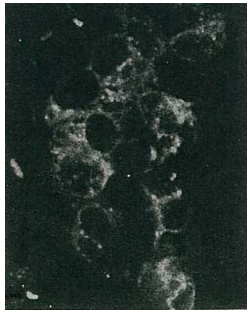
Fig.2 Detection of HCV NS5a protein by immunofluorescence antibody staining. Chimp liver cells were infected with recombinant vaccinia virus containing a HCV genome cDNA. After incubation for 48 hr, the cells were fixed with acetone and HCV NS5a protein was detected by indirect immunofluorescence staining using this antibody.

For research use only. Not for clinical diagnosis.