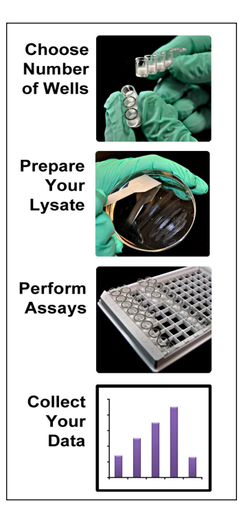
Figure 1: Simple and Quick Protocol Figure 2: Typical G-LISA® Results

The Cdc42 G-LISA® kit contains a Cdc42-GTP-binding protein linked to the wells of a 96 well plate. Active, GTP-bound Cdc42 in cell/tissue lysates will bind to the wells while inactive GDP-bound Cdc42 is removed during washing steps. The bound active Cdc42 is detected with a Cdc42 specific antibody. The degree of Cdc42 activation is determined by comparing readings from activated lysates versus non-activated lysates. Inactivation of Cdc42 is generally achieved in tissue culture by a serum starvation step (see Technical Guide). A basic schematic of the steps involved in the G-LISA® is shown in Figure 1. Typical G-LISA® results are shown in Figure 2