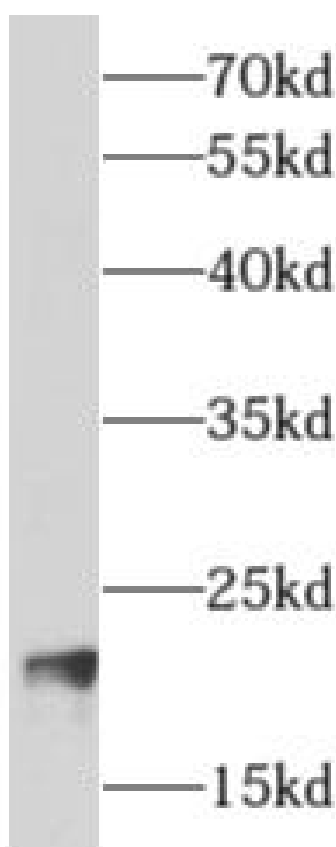
mouse brain tissue were subjected to SDS PAGE followed by western blot with FNab00530(ARF3 antibody) at dilution of 1:800