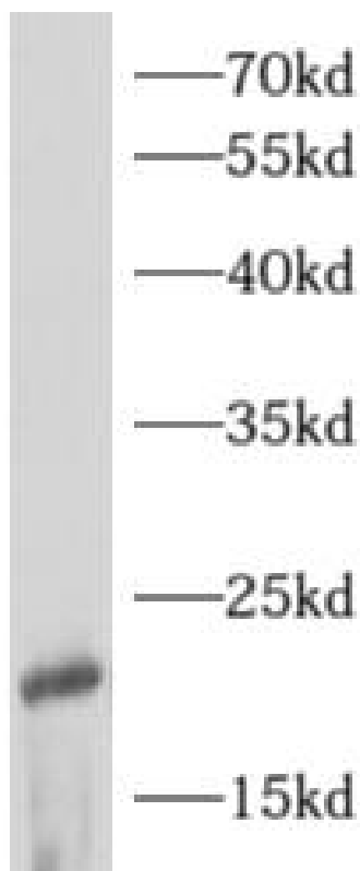
mouse brain tissue were subjected to SDS PAGE followed by western blot with FNab00531(ARF3 antibody) at dilution of 1:800