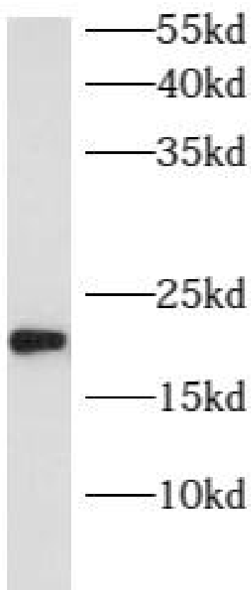
fetal human brain tissue were subjected to SDS PAGE followed by western blot with FNab00582(ARL8B Antibody) at dilution of 1:600