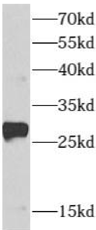
Transfected HEK-293 cells were subjected to SDS PAGE followed by western blot with FNab00586(ARMC7 Antibody) at dilution of 1:1000