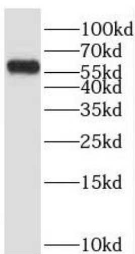
COLO 320 cells were subjected to SDS PAGE followed by western blot with FNab06643(POPDC3 antibody) at dilution of 1:1000