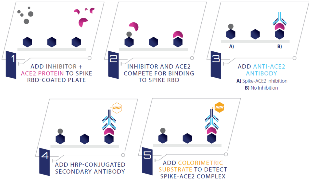
A schematic showing how the RayBio® Spike-ACE2 Binding Assay Kit can measure the inhibition of the Spike RBD and ACE2 in the presence of a potential inhibitor.