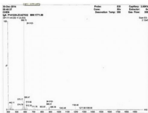
MS analysis of Immunoglobulin A Protein (OVA).

Immunoglobulin A Protein is a Mouse protein.