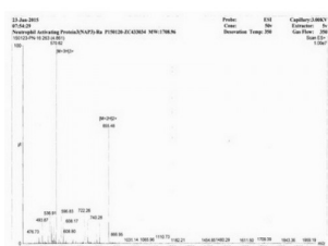
MS analysis of Neutrophil Activating Protein 3 Protein (OVA).

Neutrophil Activating Protein 3 Protein is a Rat protein.