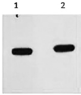
Fig. Western blot analysis of mCherry recombinant protein, diluted at 1) 1:5000, 2) 1:10000.

Note: The product listed herein is for research use only and is not intended for use in human or clinical diagnosis. Suggested applications of our products are not recommendations to use our products in violation of any patent or as a license. We cannot be responsible for patent infringements or other violations that may occur with the use of this product.