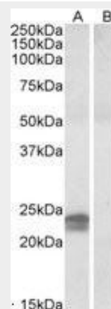
Staining (0.5 ug/ml) of Human Pancreas