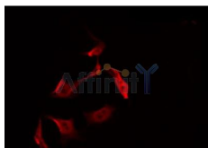
AF0049 staining 293 by IF/ICC. The sample were fixed with PFA and permeabilized in 0.1% Triton X-100, then blocked in 10% serum for 45 minutes at 25°C. The primary Ab was diluted at 1/200 and incubated with the sample for 1 hour at 37°C. An Alexa Fluor 594 conjugated goat anti-rabbit IgG (H+L) Ab, diluted at 1/600, was used as the secondary Ab.

IMPORTANT: For western blot, incubate membrane with diluted primary Ab in 5% w/v milk, 1X TBS, 0.1% Tween@20 at 4°C with gentle shaking, overnight.