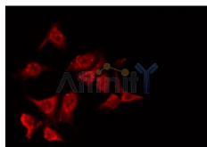
AF0441 staining HeLa by IF/ICC. The sample were fixed with PFA and permeabilized in 0.1% Triton X-100, then blocked in 10% serum for 45 minutes at 25°C. The primary Ab was diluted at 1/200 and incubated with the sample for 1 hour at 37°C. An Alexa Fluor 594 conjugated goat anti-rabbit IgG (H+L) Ab, diluted at 1/600, was used as the secondary Ab.

IMPORTANT: For western blot, incubate membrane with diluted primary Ab in 5% w/v milk, 1X TBS, 0.1% Tween@20 at 4°C with gentle shaking, overnight.