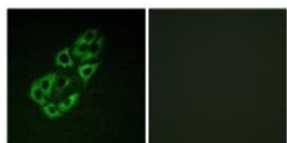
Immunofluorescence analysis of A549 cells, using MtSSB antibody A05166.