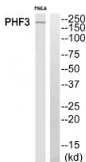
Western blot analysis of extracts from HeLa cells, using PHF3 antibody A10188.