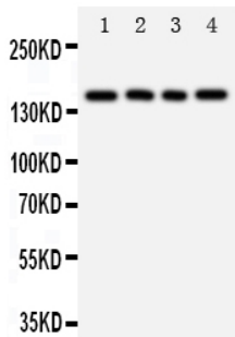
Anti-TNR antibody, PA1695-1, Western blotting All lanes: Anti TNR (PA1695-1) at 0.5ug/ml Lane 1: Rat Brain Tissue Lysate at 50ug Lane 2: U87 Whole Cell Lysate at 40ug Lane 3: HELA Whole Cell Lysate at 40ug Lane 4: MCF-7 Whole Cell Lysate at 40ug Predicted bind size: 150KD Observed bind size: 150KD