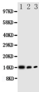
Anti-IL-4 antibody, PA1749, Western blotting All lanes: Anti IL-4 (PA1749) at 0.5ug/ml Lane 1: Recombinant Human IL-4 Protein 10ng Lane 2: Recombinant Human IL-4 Protein 5ng Lane 3: Recombinant Human IL-4 Protein 2.5ng Predicted bind size: 14KD Observed bind size: 14KD