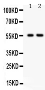
Figure 1. Western blot analysis of TRAF2 using anti-TRAF2 antibody (PB9516).

Electrophoresis was performed on a 5-20% SDS-PAGE gel at 70V (Stacking gel) / 90V (Resolving gel) for 2-3 hours.