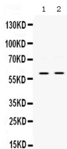
Figure 1. Western blot analysis of SKAP55 using anti-SKAP55 antibody (PB9890).

Electrophoresis was performed on a 5-20% SDS-PAGE gel at 70V (Stacking gel) / 90V (Resolving gel) for 2-3 hours. The sample well of each lane was loaded with 30 ug of sample under reducing conditions.