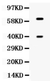
Figure 1. Western blot analysis of TPP1 using anti-TPP1 antibody (PB9899).

Electrophoresis was performed on a 5-20% SDS-PAGE gel at 70V (Stacking gel) / 90V (Resolving gel) for 2-3 hours. The sample well of each lane was loaded with 30 ug of sample under reducing conditions.