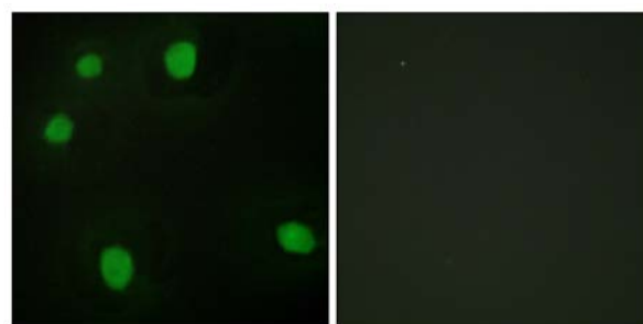
Immunofluorescence analysis of HepG2 cells, using MORF4L1 antibody.