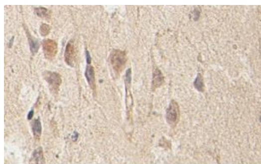
Immunohistochemical staining of formalin-fixed paraffin-embedded brain showing Cytoplasmic staining with anti- NAT1 antibody at a dilution of 1/100.

(1) Dai,Y., Leng,S., Li,L., et al.Effects of genetic polymorphisms of N-Acetyltransferase on trichloroethylene-induced hypersensitivity dermatitis among exposed workers.Ind Health 47 (5), 479-486