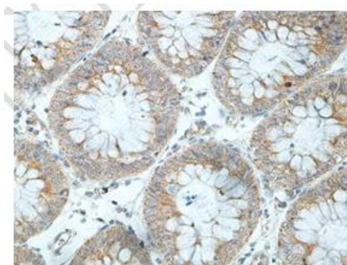
Immunohistochemical staining of formalin-fixed paraffin-embedded fetal colon showing cytoplasmic and nuclear staining with anti-RPS6KL1 antibody at a dilution of 1/100

Optimal dilutions/concentrations should be determined by the end use