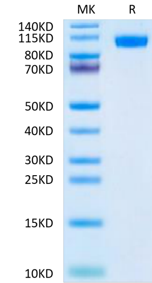
Mouse NCAM-1 on Bis-Tris PAGE under reduced condition. The purity is greater than 95%.