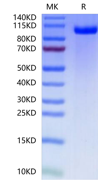
Mouse PTK7 on Bis-Tris PAGE under reduced condition. The purity is greater than 95%.