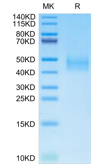
Cynomolgus DLK1 on Bis-Tris PAGE under reduced condition. The purity is greater than 95%.