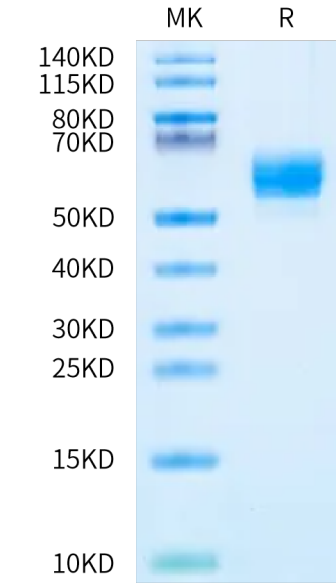
Human GITR Ligand Trimer on Bis-Tris PAGE under reduced condition. The purity is greater than 95%.