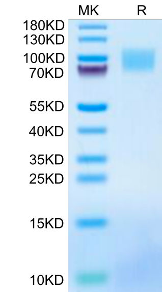
Mouse GUCY2C on Bis-Tris PAGE under reduced condition. The purity is greater than 95%.