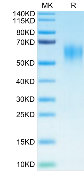
Human IL-15RA on Bis-Tris PAGE under reduced condition. The purity is greater than 95%.