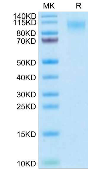
Human MERTK on Bis-Tris PAGE under reduced condition. The purity is greater than 95%.