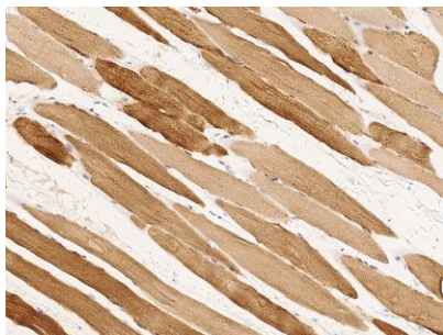
Immunohistochemical staining CKM in human skeletal muscle with rabbit polyclonal antibody at 1:1000 dilution, formalin-fixed paraffin embedded sections.

Sino Biological Biological Solution Specialist