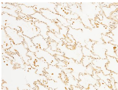
Immunohistochemical staining of human PRSS8 in human lung with rabbit polyclonal antibody (1:1000, formalin-fixed paraffin embedded sections).